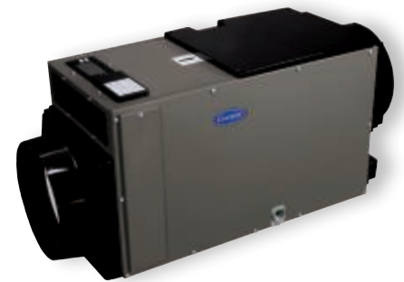
A built-in “clean filter” indicator tells you when it’s time to change the filter.

Keeping humidity under wraps can also improve the quality of the air you breathe by keeping mold and some allergens under control.* It can help prevent warping or structural damage to wood flooring or furnishings. And, setting your dehumidification levels is simple and convenient using the LCD control that can remain on the dehumidifier cabinet or installed at a more easily accessed location.